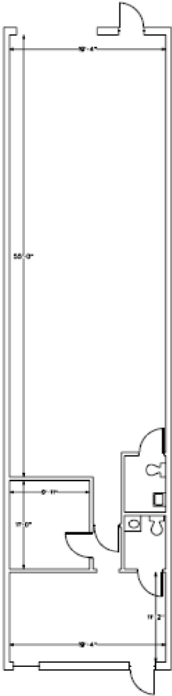
2289 1600 SF 389 SF OFFICE